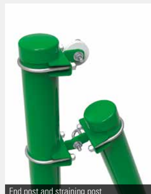
End post and straining post