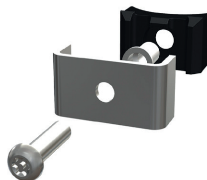
dB-Stop® fixing system