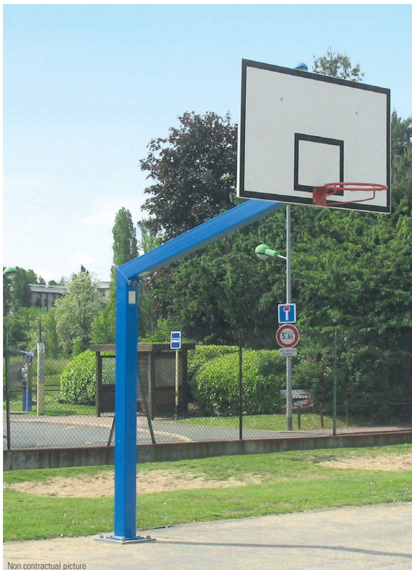
Non contractual picture

Ref. BB131602RE-A Ref. BB131603RE-A Ref. BB131702RE-A Ref. BB131703RE-A