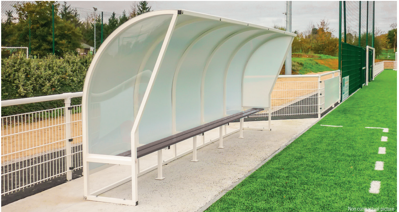
Non contractual picture