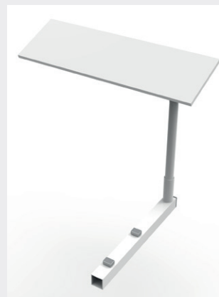
Writing tablet option