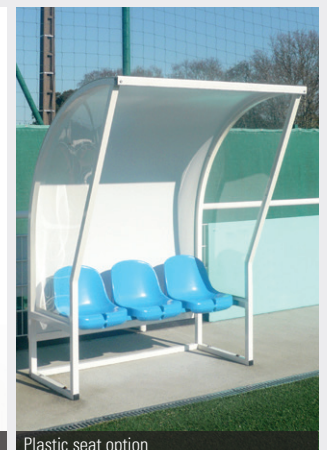
Plastic seat option