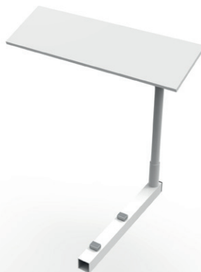
Writing tablet option