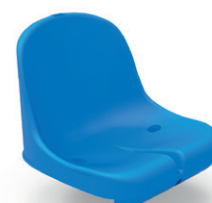
Plastic seat option