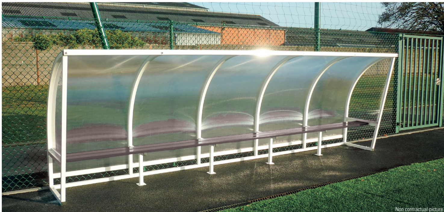
Non contractual picture